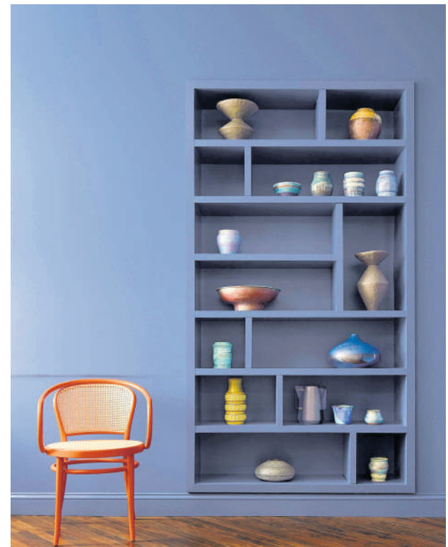
Benjamin Moore: Blue Nova.