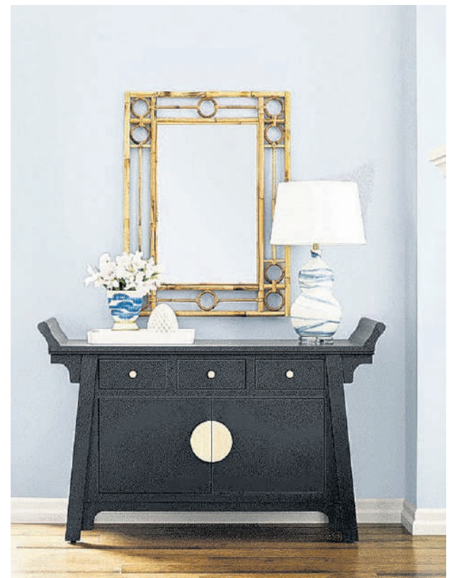
Sherwin-Williams: Upward.