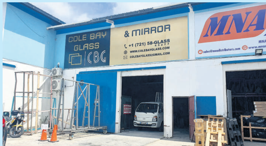
Cole Bay Glass & Mirror is conveniently located in the Jobco Complex, next to MNA Auto-Parts.

discover how the team can transform your space with the beauty and versatility of glass. E-mail coleybayglass@gmail.com , call/WhatsApp 58-GLASS (45277), visit www.colebayglass.com or check out CBG at Well Road #9 in Cole Bay, in the Jobco Complex, unit 6 (next to MNA Auto-Parts) between 8:00am and 4:00pm.