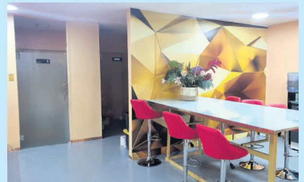
The team at CBG welcomes you in its surprisingly cosy meeting room, nestled above the warehouse. You'll be able to view samples that help you to visualise your projects. A custom frosted glass door is seen on the left.

Diverse hardware accessories: Personalise installations with CBG's selection of hardware in various