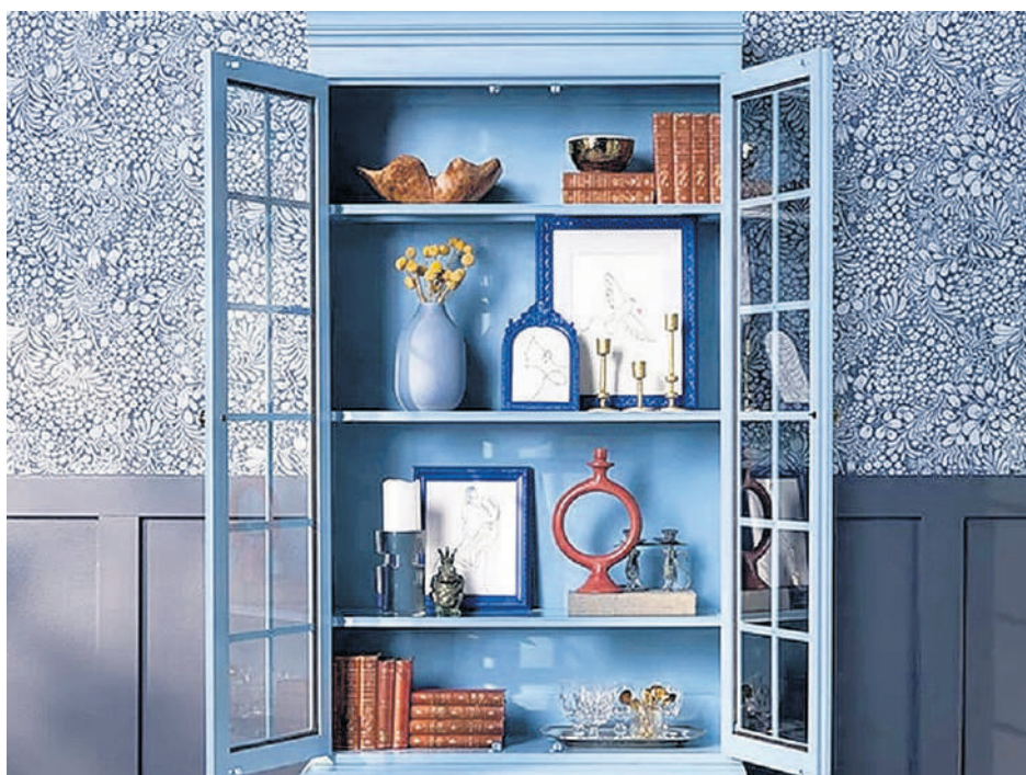
Rust-Oleum: Satin French Blue.