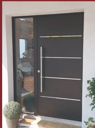
Decorative door panels, several models to choose: Stock in white and gray 800 x 2100 900 x 2100