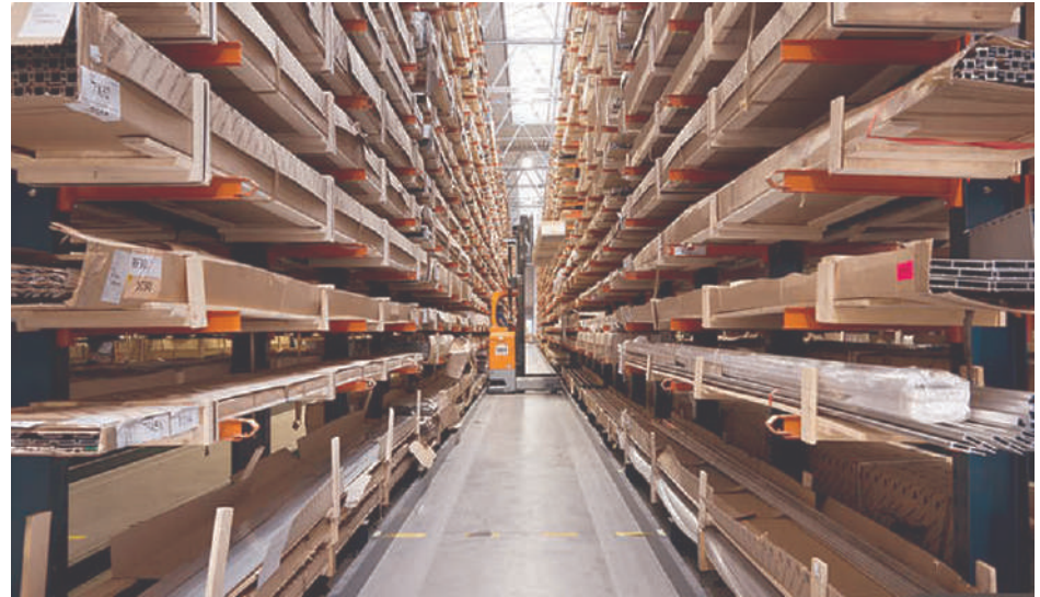
A section of Business World Aluminium.