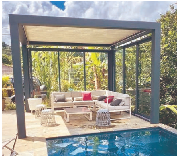
Bioclimatic Pergola profiles. Stocked in the colours white and grey (175 x 175 beams).

"Construction in St. Martin is enjoying a new boom, and customers investing on this beautiful island today are demanding quality products that respond to climatic constraints. BWA and its partners offer certified aluminium products tested for wind and rain, and manufacturing accessories that meet the new demands of architects and customers worldwide," the company said.