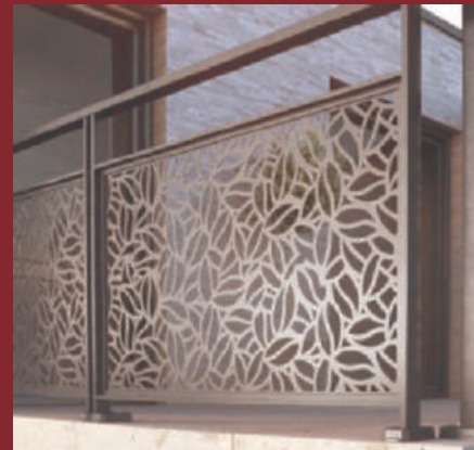
Decorative aluminum panels 4 different models to choose from to suit our gates, doors and guardrails Stock in white and gray 850 x 1800