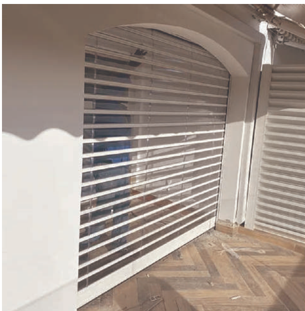
Transparent blades for roller shutters: 500mm. In stock in the colours white and grey.